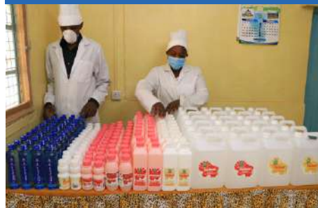
Staff display University yoghurt & drinking water at the Production Store

The University produces KEBS certified products. These products are used within the University whereas others are used to generate revenue for the University. Necessary approvals were obtained from the Public Health Offices and the Kenya Dairy Board for the production of Water and Yoghurt