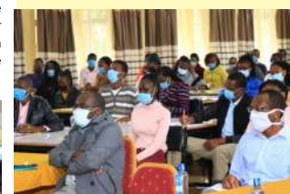
Participants follow proceedings of the 6 th postgraduate students publishing workshop held on 6 th June, 2021 at the University's Charter Hall

In its commitment to provide excellent training and development opportunities for its staff, the University, has carried out planned trainings geared towards equipping its personnel with the required competency.