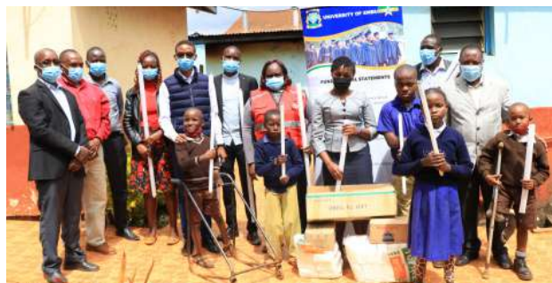
University of Embu staff donate food items and fluorescent bulbs to Jomo Kenyatta Children's Home on 30 th June, 2021.

Despite the challenges posed by the COVID-19 pandemic, the University continued to carry out its CSR activities during the 2020/2021 Financial Year. In recognition of the need to contribute towards the Country achieving its goal of planting two million trees by the year 2022, which