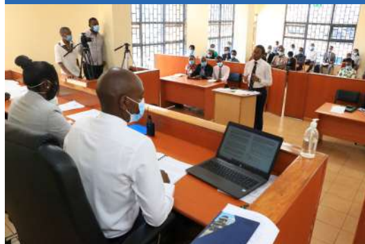
Law students participate in the Moot Court competition held at the University of Embu on 12 th March, 2021.

Moot court competition, a century old legal simulation process of training lawyers helps to gauge, engage and prepare law students for effective legal case presentations, courts trials and proceedings. The School of Law participated in the inaugural Kenya National Disability Rights Moot Court Competition organised by the University of Nairobi's School of Law held between 17 th to 28 th May, 2021. The competitions focused on challenges facing persons with mental disabilities and the