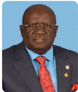
PROF. GEORGE MAGOHA, Ph.D, MBS, EBC, CBS Cabinet Secretary, Ministry of Education

I congratulate the graduating Class of 2021 of University of Embu. We share in your happiness and recognise your diligence and hard work throughout