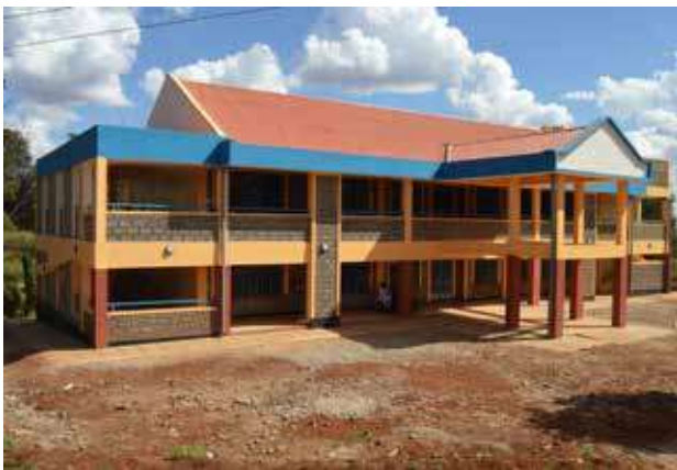
The newly completed Office Block