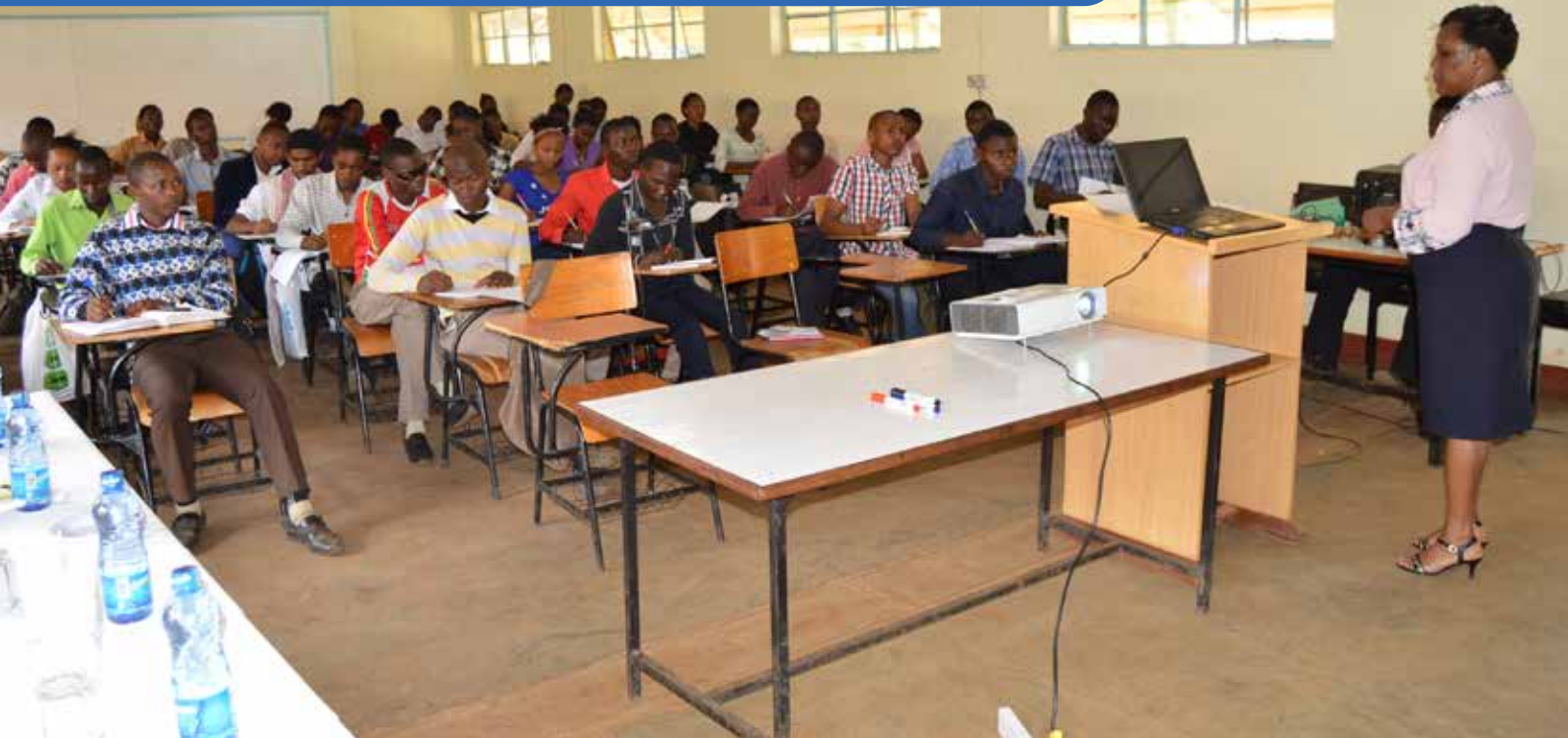
Students during the Peer Counselling Training conducted between 17 th – 19 th March 2017 in the University.