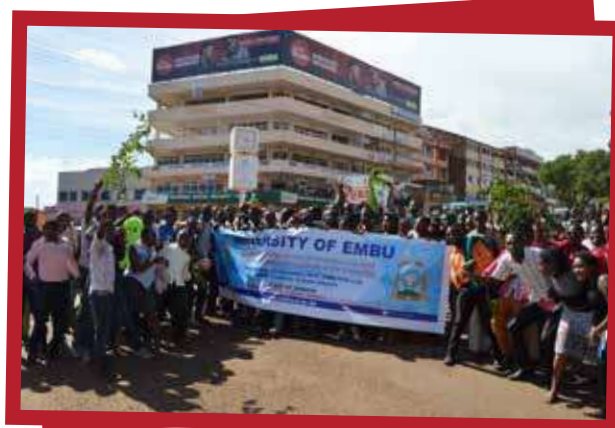
Students take part in a roadshow celebrating the award of Charter held on 25 th November, 2016 in Embu.

Other activities that have taken place during the second semester include: a student training on first aid, peer counseling and personal branding for the 4th year graduating class. We look forward to keeping you posted with new developments on the next edition of the Flashlight Magazine.