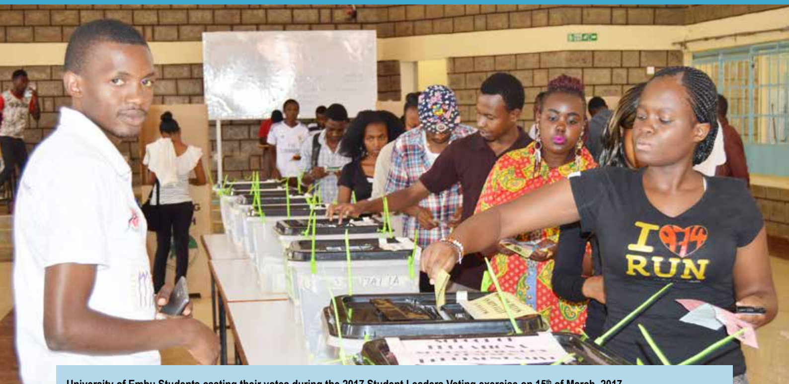
University of Embu Students casting their votes during the 2017 Student Leaders Voting exercise on 15 th of March, 2017.

The Universities (Amendment) Bill, 2016 was signed into law by the President of the Republic of Kenya, His Excellency Uhuru Kenyatta, in December 2016. Following this enactment, the University of Embu appointed a nine-member committee to review and align the then Embu University College Students' Association (EUCSA) constitution to the Universities (Amendment) Act 2016 – particularly section 41 of No. 42 on student elections.