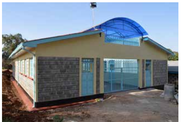
The newly completed University Herbarium