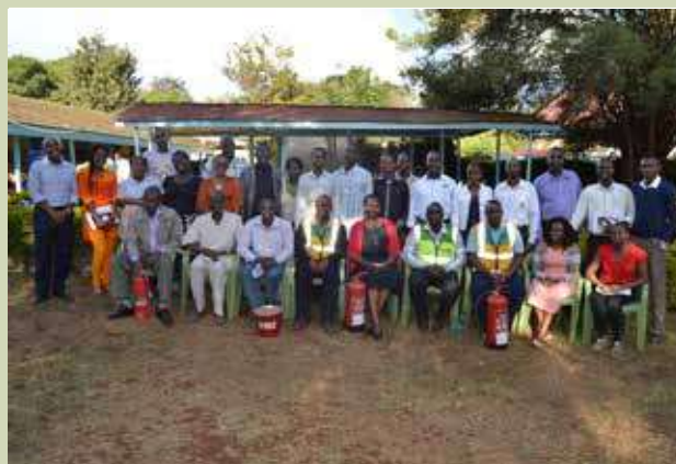
Fire Marshals training conducted by St. John Ambulance Officials on 28 th March, 2017, for staff and students.