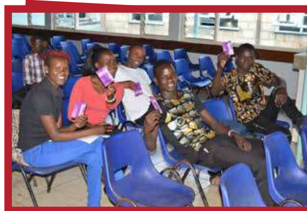
Some of the students during World AIDS Day celebrations held at the University on 1 st December, 2016.