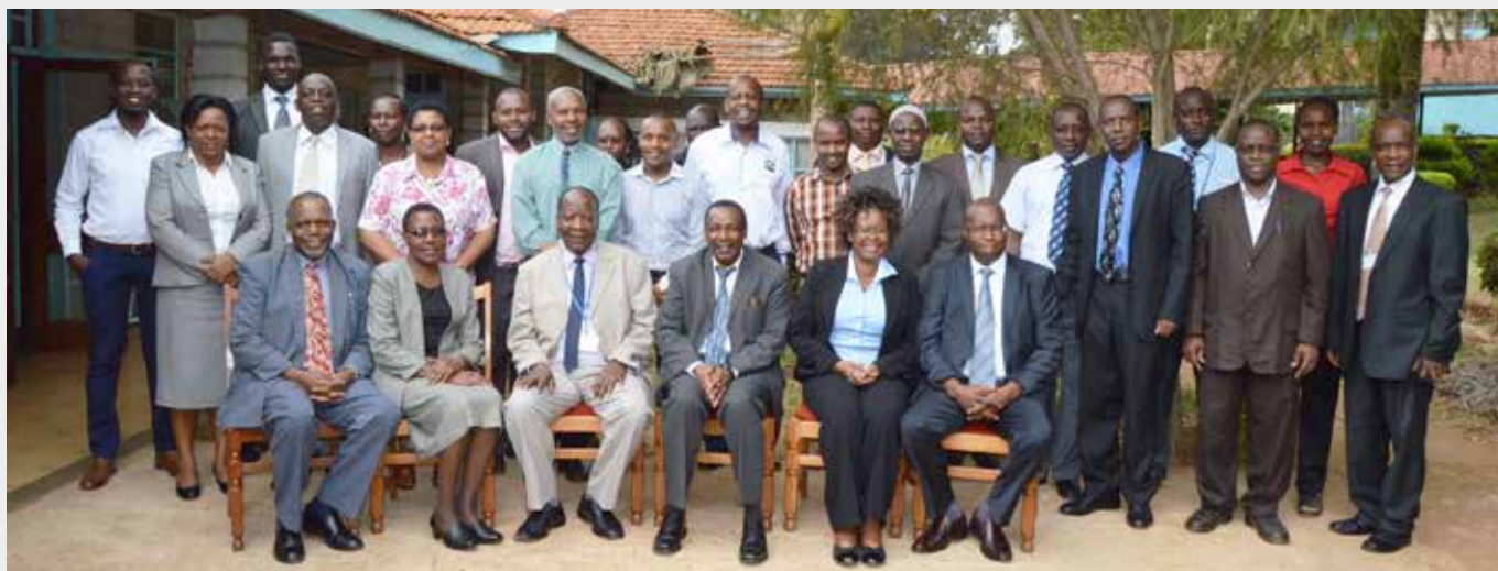
Commission for University Education (CUE) officials and UoEm staff during the Quality Audit Inspection on 1 st February, 2017 at the University main campus.

The Commission for University Education (CUE) conducted a quality audit at the University of Embu (UoEm) from 1 st to 2 nd February 2017. The Audit was conducted to establish the extent to which universities were complying with the Universities Act 2012 and the Universities Standards and Guidelines 2014; and to assure the public and other stakeholders that quality University Education is taking place in Kenyan universities.