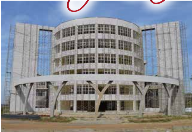
The new Administration Block