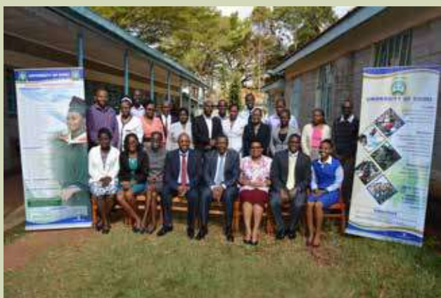
University of Embu Staff during the Job Analysis Training conducted by PricewaterhouseCoopers (PwC) & Salaries and Remuneration Commission (SRC) on 4 th April, 2017.