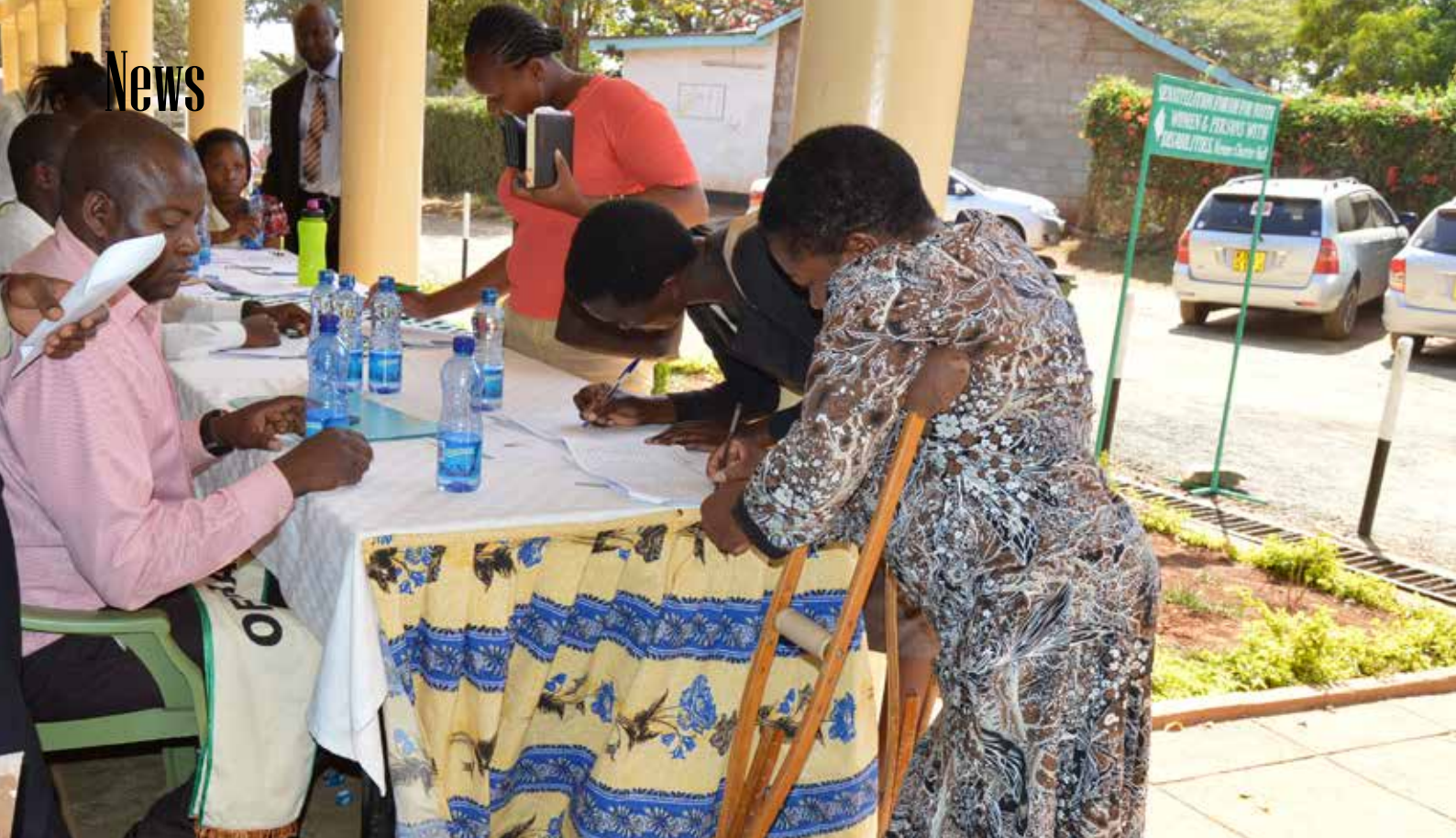
Participants register for the Sensitization Forum for Youth, Women & Persons with Disability held on 8 th March, 2017 at the University Charter Hall.