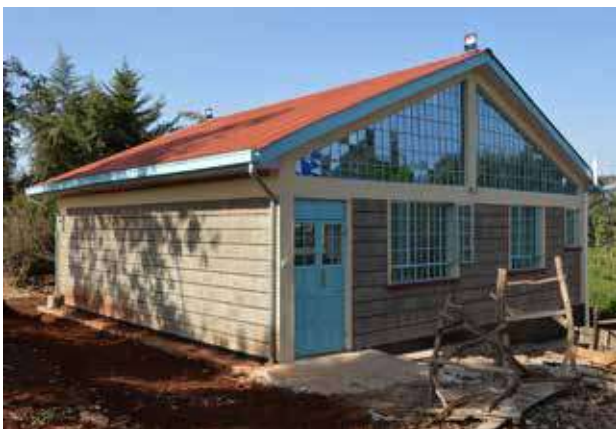
The newly completed Animal House