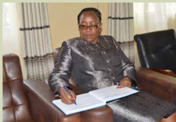
Hon. Sicily Kariuki, the Cabinet Secretary, Ministry of Public Service, Youth and Gender Affairs, signing the visitor's book in the Vice-Chancellor's Office on 13 th February, 2017, when she visited the University.