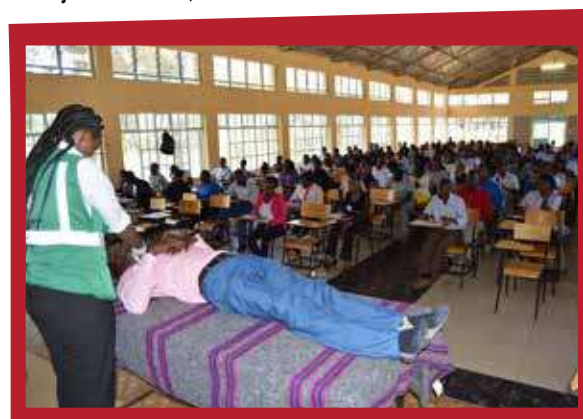
University of Embu students observe as a St. John Ambulance First Aid Trainer demonstrates how to administer Cardiopulmonary resuscitation (CPR) during a First Aid training held at the University Charter Hall on 29 th March, 2017.