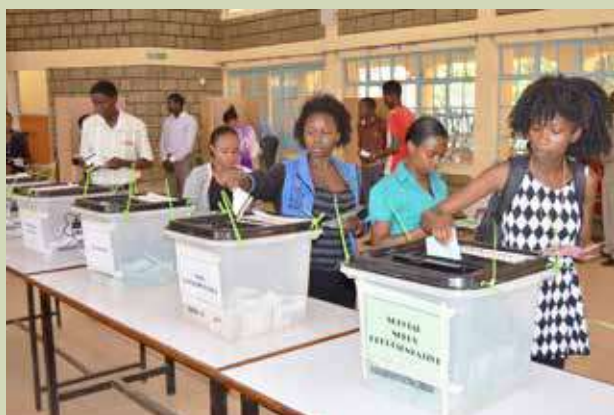
University of Embu students casting their votes during the Student Council elections held on 15 th March, 2017 in the University Charter Hall.