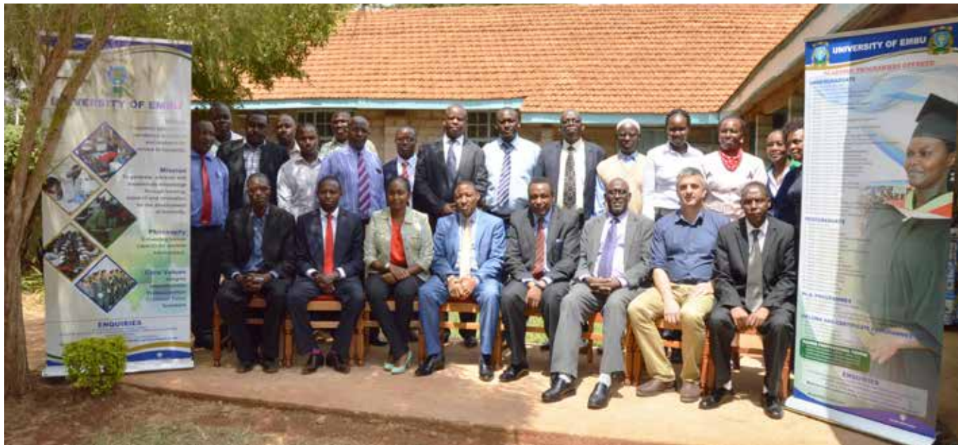
UoEm senior members of staff and Solar Power & Infrastructure (SPI) representatives after a consultative meeting on Solar Energy held on 30 th March 2017 at the University main campus.