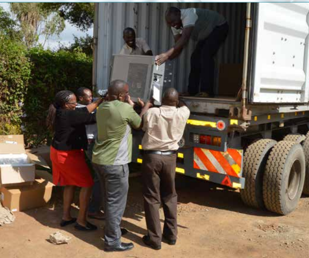
The donated lab equipment by Seeding Labs being offloaded at the University on 8 th December, 2016.

The University of Embu is one of the 16 universities selected to receive research and teaching equipment through Seeding Labs' Instrumental Access programme