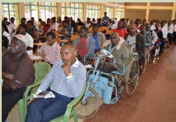
Participants following the proceedings during the Sensitization Forum for Youth, Women and Persons with Disabilities on 8 th March, 2017 at the University Charter Hall.