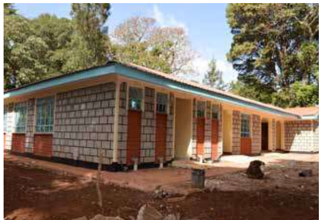
The newly completed University Guest House