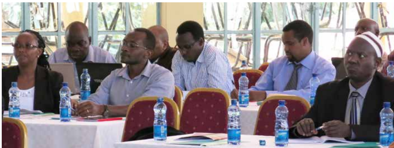
A section of UoEm's academic staff following the proceedings of the Postgraduate Supervision Workshop held on 13 th December, 2016 at the University Charter Hall.