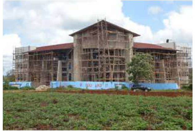
The upcoming Ultra-Modern Library