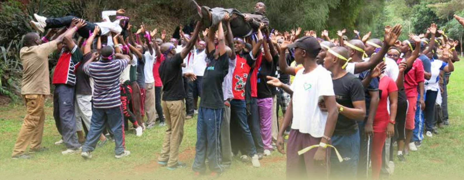
University of Embu Staff during a Team Building exercise on 21 st December, 2016.

Team-building activities can help develop trust among employees. Trust is a critical component to business, especially when teamwork is required on a daily basis to achieve objectives and grow companies. Depending on the varied personalities of employees, unnecessary conflicts and disputes might arise. Team-building activities can play an important role in easing conflicts between co-workers by allowing employees to bond with one another and become more accustomed to each other's personalities.