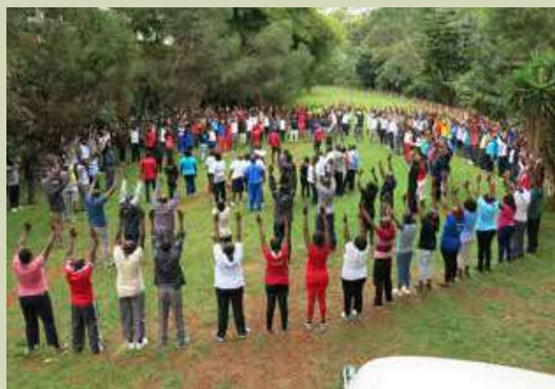
University of Embu members of staff during the Team Building held on 21 st December, 2016 at Green Hills Hotel, Nyeri.