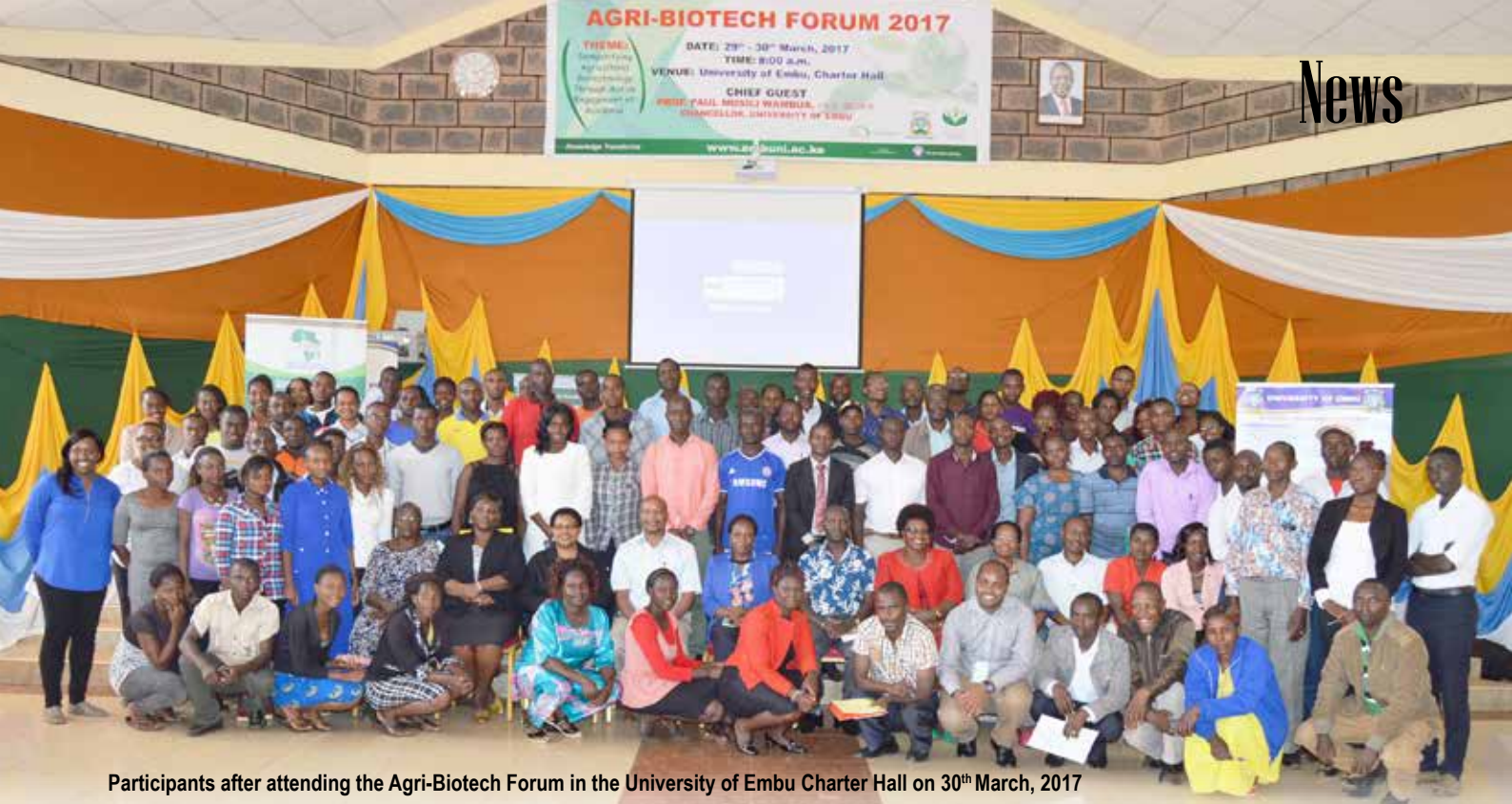
Participants after attending the Agri-Biotech Forum in the University of Embu Charter Hall on 30 th March, 2017