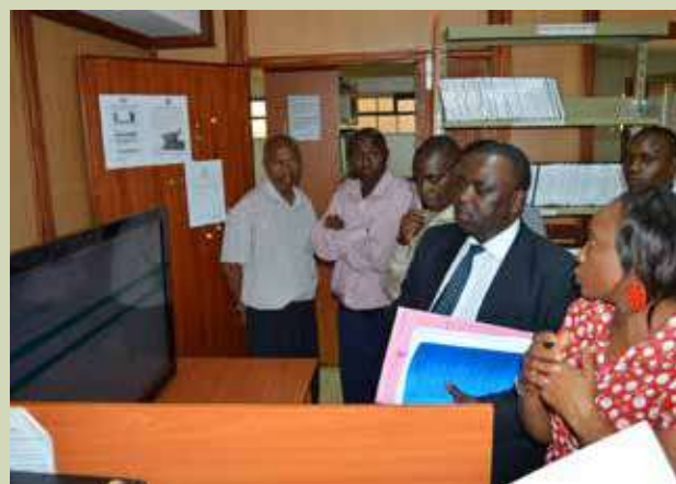
Officials from Kenya Accountants and Secretaries National Examinations Board (KASNEB) inspecting e-Books in the University Library on 20 th February, 2017.